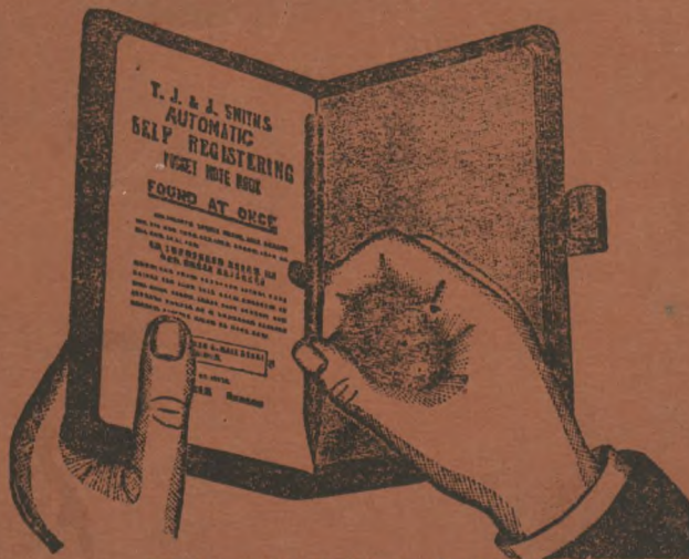
The Pencil held in place by Steel Spring.