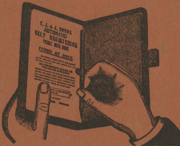
The Pencil held in place by Steel Spring.