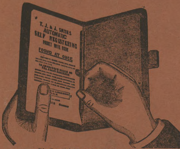
The Pencil held in place by Steel Spring.