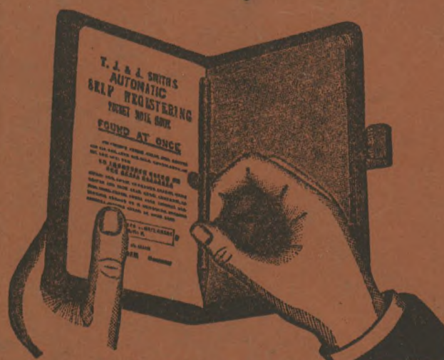
The Pencil held in place by Steel Spring.