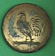
GILDED LIVERY BUTTON. COCKEREL MOTIF. 'FIRMIN & SONS 163 STRAND' ON BACK. 1783-1796. P C SEVEN ACRES 830 9970. 6-11-98 UKDFD. 13397