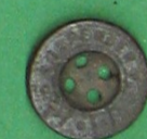
DUNGAREE BUTTON IMPRINTED: "SUSPENDER" HAYDONS 1247 4-11-00