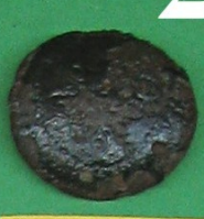
ONE-PIECE BUTTON WITH RING PATTERN 17 th CENTURY. P PARSONAGE PARK 992. B. RB. 2002.01098754-28306