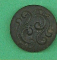
COPPER-ALLOY DECORATED THREE-PIECE BUTTON. FLORAL PATTERN. PROBABLY VICTORIAN. HILL CLOSE 967 1006D 25-5-99