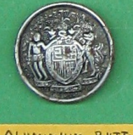
ALUMINIUM BUTTON OFF DUNCARREES? RECENT. HIGHER SHEPHERD PARK 643 1000 G. 19-6-98 C UKDFD. 13392