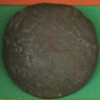
BUTTON WITH ENGRAVED LINE & FLORET PATTERN 17 th CENTURY GATON STILE FIELD 481 819A 13-10-03