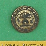
LIVERY BUTTON 'WHEAT SHEAF & FLEECE & 'LABORE' CREST OF THE MADDY FAMILY. HIGHER LAMB PARK 993A RB. 1730 0109 8754 26-11-04 C UKDFD. 13469