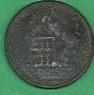
LIVERY BUTTON. GAUNTLET CHAIN & PORTCULLIS PATTERN. 'FIRMIN & WESTALL, STRAND ON BACK. 1797-1801 SEVEN ACRES 1265 997A 5-8-01 UKDFD. 13510