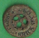
DUNGAREE BUTTON. STAMPED "HOBBS & SON, GARRICK ST. W.C." PARSONAGE PARK 992. E. PG. 2286.01098754.31-3-08