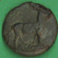
THREE-PIECE LUCKY BUTTON. "STAG" MOTIF. EVIDENCE OF AN IRON CORE. (FOUND NEXT TO 830) SEVEN ACRES 831 997.0. 6-11-98