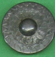
ENGRAVED WHITE-METAL BUTTON. CENTRAL BOSS AND INTRICATE ENGINE ENGRAVING. P LOWER HAM 589 1397J 10-2-98