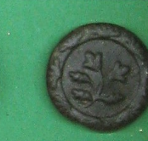
COPPER-ALLOY THREE-PIECE BUTTON. 'LONDON QUALITY' ON BACK. FLORAL PATTERN FIR FIELD 786 809D 23-9-98