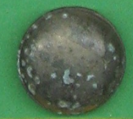
DOMED PEWTER BUTTON. C NEWTON'S FIELD 730 F. JP 1839.99708816. 26-9-05