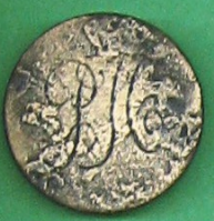
COPPER-ALLOY ENGRAVED BUTTON. HAND ENGRAVED 'PH' PROBABLY GEORGIAN HIGHER SOWHILL FIELD 973 1004B 31-5-99