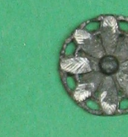
FLOWER-PATTERNED SILVER-PLATED BUTTON. 18 th CENTURY HILL CLOSE 679 1307D 13-7-98