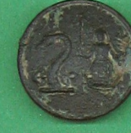
LIVERY BUTTON 19 CENTURY. EMBOSSED WITH SWAN & ANCHOR; FIGURE IN CROWN HOLDING SWORD & OLIVE BRANCH SANDY HILLS 423 1285A 7-7-97 C UKDFD. 13392