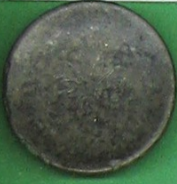
DISHED PEWTER BUTTON. ENGINE TURNED FLORAL CENTRAL PATTERN PARSONAGE PARK 899 934I 29-1-99