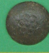
BUTTON WITH FLORAL DESIGN. GILLBROOK ORCHARD 1463 B. ET. 1681 00848680 24-9-04