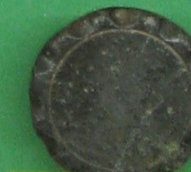
TOMBAC BUTTON WITH CRENELLATED EDGE. C GREAT TANK HILL 1026 A. RH. 1946.98838778. 30-1-06