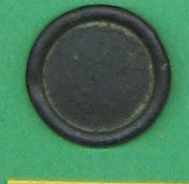
COPPER-ALLOY BUTTON. PROBABLY VICTORIAN LOWER FIELD 419 1236B 29-6-97