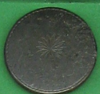
ENGINE-ENGRAVED WHITE METAL BUTTON 18 CENTURY. WILL PARK 760 929D. 6-9-98