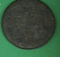
COPPER-ALLOY BUTTON WITH 'BASKETWEAVE' PATTERN. LAUREL-LEAF EMBLEM ON BACK. WILL PARK 927 929C 26-9-99