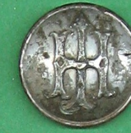
SILVER-PLATED LIVERY BUTTON. EMBOSSED 'H.I.' & 'DAUGHTY & CO: 103 ST MARTINS LANE' WINDMILL HILL 850 800G 29-6-96 C UKDFD. 13379