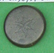
WHITE-METAL BUTTON. ENGRAVED WITH CENTRAL FLORAL PATTERN. GEORGIAN-VICTORIAN. C THORN PARK 554 1104 F 17-1-98