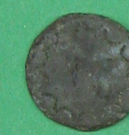
COPPER-ALLOY BUTTON. WITH SEMICIRCULAR DOTTED RIM PATTERN. 18-19 th C HIGHER SHEPHERD PARK 1094 1000A 18-10-99