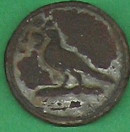
LIVERY BUTTON. PHEASANT & GILLYFLOWER MOTIF. 19 C. BONFIRE 1301 1105E 27-9-01 UKDFD. 13621