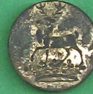
STAG-PATTERNED LIVERY BUTTON. LITTLE SEWHILL 1090 A JG. 1516 00058752 31-12-03 C UKDFD. 13395