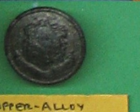
COPPER-ALLOY LIVERY BUTTON. COAT OF ARMS & INSCR. IPTON ON FRONT. BACK - 'P & S FIRMIN, LONDON' HAYDONS 1242 4-11-00 C UKDFD. 13353