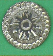
SILVER-PLATED BUTTON WITH SUNBURST PATTERN. C GEORGIAN. 18 th C. P THORN PARK 541 1104.D 30-12-97