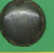
TOMBAC BUTTON RUST AROUND EDGES. ORIGINALLY IRON-BACKED. C LITTLE TANK HILL 909 G. RH. 1962.98838778. 30-1-06