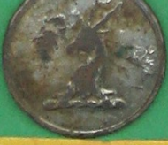
SILVER-PLATED LIVERY BUTTON. LOGO: ELAND-TYPE HEAD ON ROPE BASE MIDDLE FIELD 999 A. PG. 1751 0051 8773 1-2-05 C UKDFD. 13353