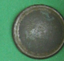
BUTTON WITH SILVER RIM PATTERN. 'H.T. & SONS, EXTRA QUALITY' ON BACK. HAMMOND TURNER & SONS. HIGHER LAMB PARK 993 F RB 1594 01098754 5-4-04