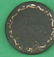
COPPER-ALLOY BUTTON. GILT RIM PATTERN 18 th CENTURY QUARRY PARK 968 1003A 26-5-99