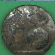
LIVERY BUTTON OF THE DRAKE FAMILY 1839-1849 SEVEN ACRES 1102. E. PG. 2129.0074 8793. 7-2-07 C UKDFD. 25173