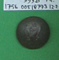
DOMED LIVERY BUTTON. EMBLEM OF PHOENIX RISING? GILLBROOK SEWARD 1344 1463G 20-7-02 C UKDFD. 13472