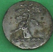
SILVER-PLATED LIVERY BUTTON MOTIF: ARM GRASPING OAK BRANCH WELL PARK C 558 995F 20-1-98 UKDFD. 13322