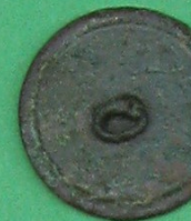
TINNED COPPER-ALLOY BUTTON WITH THICKENED RIM. 18 th CENTURY. UNUSUAL IN HAVING A RIM. FOUR ACRES 159 K 21-10-96