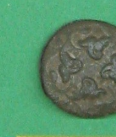
BUTTON WITH FLORAL PATTERN PARSONAGE PARK 992 B RB. 1711 01098754 5-11-04