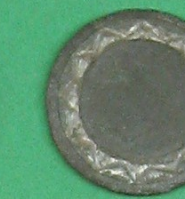
BUTTON WITH SILVER INLAY PATTERN. VICTORIAN PARSONAGE PARK 992 C RB 1588 01098754 2-4-04