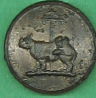
LIVERY BUTTON WITH INDIAN RHINO MOTIF. HOME CLOSE 481 1087D. 16-9-97 P UKDFD. 13392