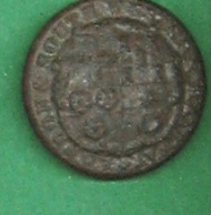
LONDON AND SOUTH-WESTERN RAILWAY BUTTON. ELM FIELD 928 JG. A 1501 001 877 11-12-03 P UKDFD. 13709