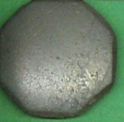
OCTAGONAL PEWTER BUTTON PARSONAGE PARK 992 D RB. 1611 01098754 13-9-04