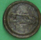
COPPER-ALLOY HUNTING BUTTON, WITH FOX EMBLEM. LONGFIELD 1223 80A 15-2-00