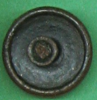
WOOD-FILLED BUTTON WHEN FOUND CAVITY FILLED, BUT DUMPERATED. INSCRIPTION ON BACK: "REGISTERED SEPT. 21 1875" SEVEN ACRES 115 G 13-10-96