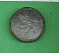
ENGRAVED WHITE-METAL BUTTON. CENTRAL LEAF PATTERN. GEORGIAN/VICTORIAN. C BRAKE'S CLOSE 471 910/835H 7-9-97