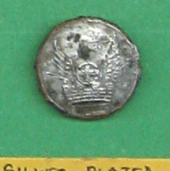
SILVER-PLATED LIVERY BUTTON. MOTIF: WINGED CROSS ON A CROWN HEATHCOTE FAMILY. MEADOW. 1228 1098A 19-8-00 C UKDFD. 13405