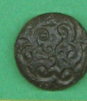
PATTERNED HOLLOW BUTTON 19 th CENTURY. BONFIRE 257 C 20-1-97