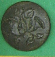
BUTTON WITH FLORAL PATTERN. STAMPED: "TREBLE STAND EXTRA RICH" HIGHER LAMB PARK 993 A. RB. 1707 01098754 19-10-04