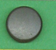
LEAD-TIN ALLOY BUTTON IN EXCELLENT CONDITION. PROBABLY VICTORIAN. GILLBROOK ORCHARD 105 E 2-10-96