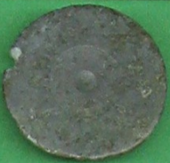
ENGINE-TURNED PEWTER BUTTON UNUSUAL PATTERN ELM FIELD 927 JG. F 1500 001877 10-12-03