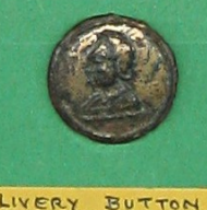
LIVERY BUTTON HELMETED HEAD EMBLEM. 19 C. WELL PARK 995A. PG. 2165.0083758.29-6-07 C UKDFD. 13620