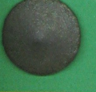
'COOLIE-HAT' BUTTON LOWER TWO ACRES 1400 A. JS. 1738 00308685 7-12-01