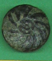
HOLLOW COPPER ALLOY BUTTON WITH WHEEL PATTERN 17 th CENTURY P ELM FIELD 75 A 14-6-96