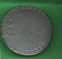
ENGINE-TURNED TOMBAC BUTTON. FOUR ACRES 1357 1308E 24-8-02