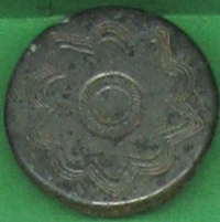
ENGINE-TURNED PEWTER BUTTON HILL CLOSE 1461 1307A 28-9-03