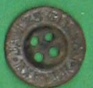
DUNGAREE BUTTON. STAMPED: "JAMES GIBSON, EXETER" PARSONAGE PARK 992 F. RB. 1715 01098754 5-11-04