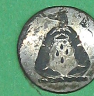
SILVER-PLATED LIVERY BUTTON. MOTIF OF TWO ARMS HOLDING A GREYHOUND'S HEAD. MEAD 497 667E 17-10-97 C UKDFD. 13333