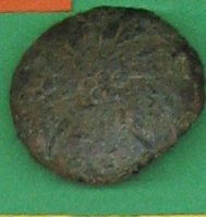
COPPER-ALLOY DOMED BUTTON, 17 th CENTURY ENGRAVED WITH FLORAL PATTERN. IRON SPLIT PIN STILL ATTACHED TO BACK. QUARRY PARK C 796 996E 3-10-98