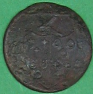
LIVERY BUTTON WITH HERALDIC SHIELD. REVERSE: 'E. JONES, DUBLIN. 'CANTRELL' FAMILY 19C. GILLBROOK MEADOW 53 I 25-7-96 C UKDFD. 13652