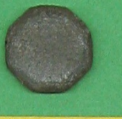
OCTAGONAL BUTTON HIGHER LAMB PARK 993 E RB. 1566 01098754 21-3-04