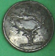
SILVER-PLATED LIVERY BUTTON. MOTIF: DOG OVER STAG'S HEAD. MIDDLE FIELD 669 999D 7-7-98 C UKDFD. 13370