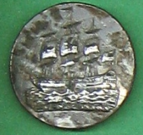
SILVER-PLATED, COPPER-ALLOY LIVERY BUTTON, WITH SAILING SHIP LOGO. 18-19 C. SEVEN ACRES 1131 997D 2-2-00 UKDFD. 13330