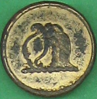
GILT-PLATED LIVERY BUTTON. REVERSE: 'EXTRA SUPERFINE, BEST QUALITY'. FOUR ACRES 224 K 3-12-96 UKDFD. 13399