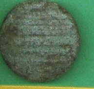
BUTTON WITH PATTERN OF STRIPES. EVIDENCE OF GILDING GEORGIAN/VICTORIAN LONG CLOSE 1369 1707C 12-4-03