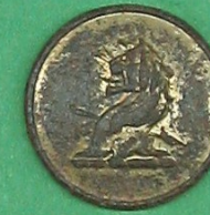
LIVERY BUTTON. LION'S HEAD EMBLEM. HOME CLOSE 1087A PG. 1667 9990 8735 25-8-09 C UKDFD. 13393