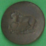
COPPER-ALLOY HOLLOW BUTTON. RAISED PATTERN OF A HORSE. GILLBROOK ORCHARD 1338 1463A 20-7-02