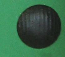
CONVEX HOLLOW BUTTON WITH PATTERN OF PARALLEL LINES LATE 17 th - MID 18 th CENT. MIDDLE FIELD 69 B 2-8-96