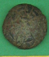
CAST COPPER-ALLOY ONE-PIECE HOLLOW-DOMED BUTTON WITH FLORAL DECORATION 17 th CENTURY. GLOBE FIELD 947 1101C 2-5-99