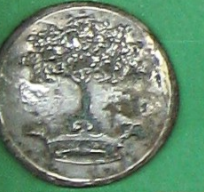
SILVER-PLATED LIVERY BUTTON. MOTIF: TREE OVER CORONET 19 C. P GREAT CRAYTONS 355C.TT. 1645 997183 03 10-6-04 UKDFD. 13329