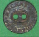
DUNGAREE BUTTON STAMPED: "MACKAY & CO, DEVONPORT" GILLBROOK ORCHARD 1463. F. ET. 2202.00848680.3-9-07