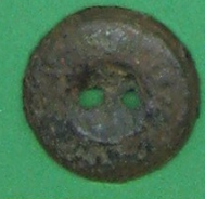
COPPER-ALLOY BUTTON. UNUSUAL PATTERN SOUTH CLOSE 1416 357B 13-6-03