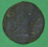
COPPER-ALLOY BUTTON WITH HORSE & TRAP MOTIF. IMPRESSED NOT CAST THORN PARK 543 1104A. 8-12-97