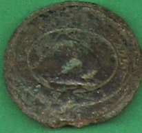
LIVERY BUTTON ARM WITH SWORD EMBLEM. 2 'PAX POS... BELLO' W. BOCCRETT & CO BONFIRE 1360 1105A 27-9-02 UKDFD. 13621