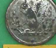
SILVER-PLATED LIVERY BUTTON. SQUIRREL MOTIF. WOOL PARK 906.B. RH. 1981.9883 8778. 9-2-06 C UKDFD. 13352