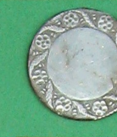
SILVER-PLATED BUTTON WITH FLORAL BORDER 18 th CENTURY LOWER LAMB PARK 1313 1107B 2-11-01