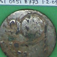
SILVER-PLATED LIVERY BUTTON SHOWING THE DRAKE FAMILY MOTIF & INSCRIPTION: 'ADRIANUS DIVINO' 1830-1850 LITTLE GORE 858 802A 23-11-98 C UKDFD. 25174