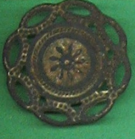
GILT-PATTERNED COPPER-ALLOY BUTTON LONG FIELD 963 812B 21-5-99