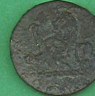
COPPER-ALLOY LIVERY BUTTON. LION-RAMPANT PATTERN. ELM FIELD 753 928I 31-8-98 C UKDFD. 13333