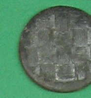
PLATED BASKETWEAVE BUTTON ELM FIELD 927 JG. A 1490 001877 9-12-03