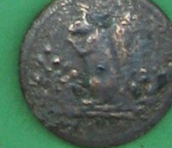
LIVERY BUTTON WITH SQUIRREL MOTIF. WOOL PARK 906.B. RH. 1879.9883 8778. 6-12-05 C UKDFD. 13352