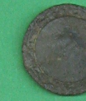
COPPER-ALLOY PATTERNED BUTTON PROBABLY 18 th CENTURY SEVEN ACRES 732 1102C. 15-8-98