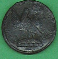
LIVERY BUTTON WITH DOVE MOTIF EARLY 19 CENTURY LITTLE FIVE ACRES 55 E 5-96 UKDFD. 13625