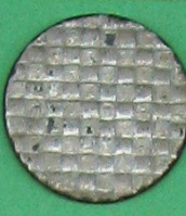
SILVER-PLATED BUTTON. COPPER-ALLOY WITH PLATED BASKETWEAVE FACE 18 th CENTURY GLOBE FIELD 1077 1101F 4-10-99