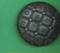
HOLLOW, THREE-PIECE COPPER ALLOY BUTTON WITH SQUARED DESIGN. PROBABLY 18 th TO 19 th CENTURY. BRAKES CLOSE 127 G 28-9-96