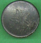
DISHED TOMBAC BUTTON. ENGINE-TURNED PATTERN. 18-19 C. HIGHER LAMB PARK 993 E. RB. 1714 01098754 5-11-04