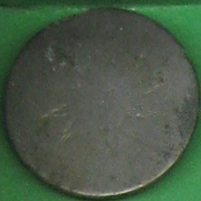
ENGINE-TURNED PEWTER BUTTON GREAT CRAYTONS 85SBIT. 1699 99718903 11-6-04