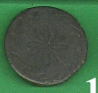
ENGINE-TURNED TOMBAC BUTTON 18-19 CENTURY. SEVEN ACRES 1101 1102D 25-10-99