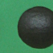
CONVEX BUTTON WITH FAINT RECTANGULAR PATTERN ELM FIELD 68 A 25-8-96