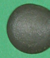
HOLLOW CONVEX BUTTON PARSONAGE PARK 992 E. RB 1722 01098754 18-11-04