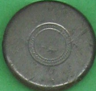
ENGINE-ENGRAVED TOMBAC BUTTON. IN BETTER THAN USUAL CONDITION. PARSONAGE PARK 957 934D 14-5-99