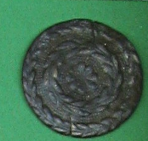
LAUREL-LEAF PATTERNED BUTTON APPLE TREE HILL 65 D 31-8-96