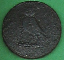
LIVERY BUTTON WITH OWL MOTIF. REVERSE: 'JOHN SAXTY, COLCHESTER'. HIGHER SHEPHERD PARK 54 G 13-6-96 UKDFD. 13476