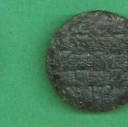
BASKET-WEAVE PATTERNED BUTTON GRAVEL PIT 479 674E 9-9-97