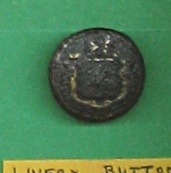
LIVERY BUTTON DESIGN: PHOENIX OVER A SHIELD WITH ENCLOSED EMBLEM & MOTTO BELOW. FOUR ACRES 1279 1308B 30-8-01 C UKDFD. 13392