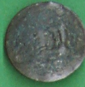
HUNTING BUTTON HORSE & RIDER DEPICTED. LITTLE SOWHILL 1090 B JG 1517 00058752 2-12-03