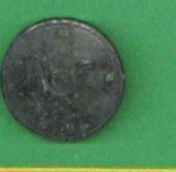
ENGINE-TURNED TOMBAC BUTTON. 18 C. C APPLE TREE HILL 925 E. RH. 1856.99908766. 23-10-05