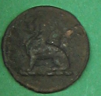
LIVERY BUTTON WITH LION MOTIF. HIGHER HAM 619 1390A 1-4-98 C UKDFD. 13392