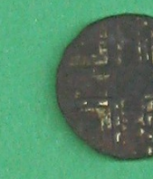
BUTTON WITH CROSS PATTERN. EVIDENCE OF GILDING 18-19 th C SEVEN ACRES 1327 1102A 26-4-02