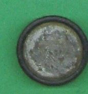
SILVER-PLATED COPPER-ALLOY BUTTON. HAND ENGRAVED PATTERN - AN INITIAL? HILL 575 440F. 4-2-98