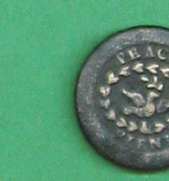
COPPER-ALLOY BUTTON. MARKED 'PEACE, PLENTY' WITH OLIVE & OLIVE BRANCH EARLY 19 th CENTURY. WELL PARK 1144 995C 10-3-00