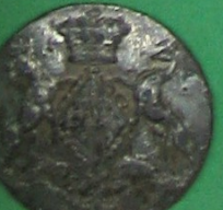
SILVER-PLATED LIVERY BUTTON A BARON'S COAT OF ARMS. 1876-1894 HIGHER LAMB PARK 993A RB. 1774 0109 8754 9-3-05 UKDFD. 13346