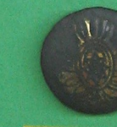
COPPER-ALLOY ORNATE BUTTON. GILDED. PROBABLY VICTORIAN. FURZE BUSHES 985 458F 9-6-99