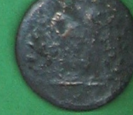
LIVERY BUTTON. 'SQUIRREL' EMBLEM? MIDDLE FIELD 999B PG. 1756 0051 8773 12-2-05 C UKDFD. 13352