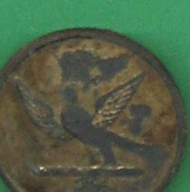
LIVERY BUTTON MOTIF: MARTLET, EXPANDED WINGS MIDDLE FIELD 999A. PG. 1842. 0051 8773. 9-10-05 C UKDFD. 13407