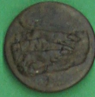
SPITTING BUTTON. DEPICTING TWO DOGS. OUTLOOK 1062 C. 16-9-99