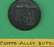
COPPER-ALLOY BUTTON WITH PORTCULLIS DESIGN. MIDDLE FIELD 670 999E 7-7-98 C UKDFD. 13353