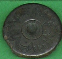
ENGINE-TURNED TOMBAC BUTTON 18-19 CENTURY. LOWER HAM 1182 1397A 22-5-00