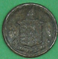
LIVERY BUTTON ARMS OF THE PETOE FAMILY OF CHESTERTON, WARWICK. BRAKE CLOSE 1418A. DA. 1679 98408703 12-9-04 C UKDFD. 18466