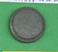
PEWTER BUTTON UNUSUAL FLATTENED RIM. HIGHER LAMB PARK 993 F RB 1554 01098754 18-3-04