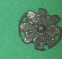
SILVER-PLATED ORNATE DRESS BUTTON HILL CLOSE 1453 1307D 6-9-03