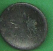
DISHED TOMBAC BUTTON. ENGINE TURNED HIGHER LAMB PARK 993 B. RB 1777 01098754 10-3-05