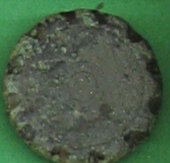
WHITE-METAL BUTTON WITH FLUTED EDGE 18 CENTURY. SEVEN ACRES 882 997F. 6-11-98