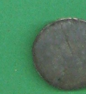
SILVER-PLATED BUTTON. PROBABLY VICTORIAN. THORN PARK 555 1104G 17-1-98