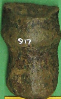
CAST BRONZE POT LEG. SY0065 8755 C SEVEN ACRES 917 997F 13.3.99