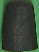
COPPER-ALLOY THIMBLE. LONG FIVE ACRES 1044 23A 27-8-99