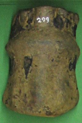
299 CAST BRONZE RECEPTACLE LEG. SY 0083 8758 C BONFIRE 299 H 22-2-97