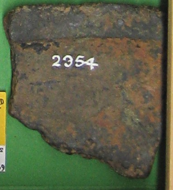
2354 BRONZE POT SHARD HIGHER FIVE ACRES 1082. A. RP. 2354. 99348737. 16-9-09