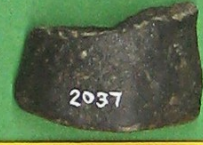
2037 FRAGMENT OF BRONZE POT LEG. HIGHER FIELD 741. B. PG. 2037. 00408814. 13-5-06