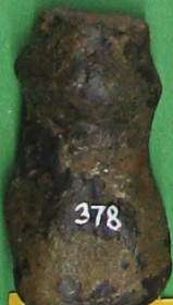
CAST BRONZE POT LEG. DATE UNKNOWN SY0034 8725 LOWER FIELD 378 1236 H 22.5.97