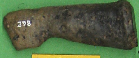
298 CAST BRONZE RECEPTACLE LEG. SMOOTH, INNER SURFACE OF POT AT TOP END. 0083 8758 THORN PARK 298 K 21-2-97