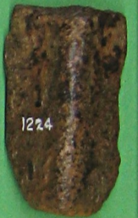
CAST BRONZE POT LEG. SY0063 8960 UN-NAM 1224 83B 15.8.00