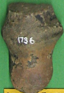
BRONZE POT LEG HIGHER LAMB PARK 993 G. RB. 1736 01098754 26.11.04