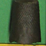
COPPER-ALLOY THIMBLE. LONG FIELD 711 812C. 4-8-98