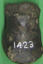
BRONZE POT LEG SY0074 8743 C SEVEN ACRES 1423 1102 D 23.6.03