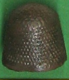
COPPER-ALLOY THIMBLE PARSONAGE PARK 992 B. RB 1563 01098754 21-2-04