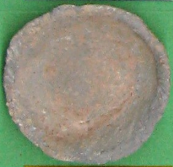
LEAD TOY DISH? MIDDLE FIELD 999 C. PG. 2180.00618773.10.8.07