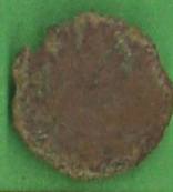
COPPER-ALLOY STUD MOUNT. TRACES OF QILT. 11-14 CENTURY? MIDDLE FIELD 999 B. PG. 1746 00518773 30.1.05