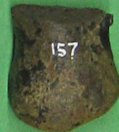
CAST RECEPTACLE LEG. 13-17 CENTURY. MUCH BLACKENED BY FIRE. SY0061 8709 FOUR ACRES 157 J 21.10.96