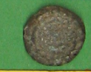
PIMPLE-PATTERNED COPPER-ALLOY MOUNT. 15-16 CENTURY? PARSONAGE PARK 992 E. RB. 1769 01098754 7.3.05