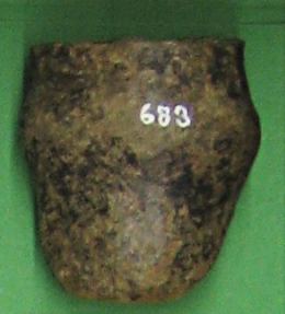
683 CAST BRONZE POT LEG. SY 0043 8732 LOWER FIELD (P) 683 1236B, 21-7-98