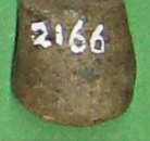
2166 BRONZE POT LEG. WELL PARK 995. B. PG. 2166. 00838758. 29-6-07