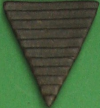
COPPER-ALLOY P TRIANGULAR BELT MOUNT. 17-18 C. RIBBED DESIGN. FOUR INTEGRAL LUGS. SEVEN ACRES 1103 1102 G 25.10.99