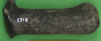
1719 BRONZE POT HANDLE FIRE-BLACKENED PARSONAGE PARK 992 B. RB. 1719 01098754 18-11-04