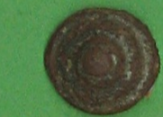
CAST COPPER CLOTHING MOUNT, WITH INTEGRAL LUGS. 17 TO 18 CENTURY. EVIDENCE OF TINNING. QUARRY PARK 318 D 13.2.97