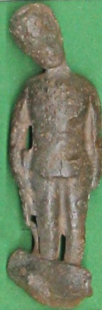
LEAD SOLDIER GLOBE FIELD 1101 B PG. 1520 00538738 2.1.04