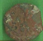
COPPER-ALLOY STUD. MARSHALL MEADOW 735 D. PG. 1670 00908814 31.8.04