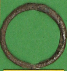
ROUGH-CAST COPPER-ALLOY RING. LARGER THAN USUAL. AT 32 MM DIAM: ELM FIELD 927 B. JG. 2044. 00148772.25.5.06