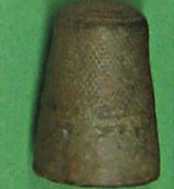
COPPER-ALLOY THIMBLE. SEVEN ACRES 946 997J 2-5-98