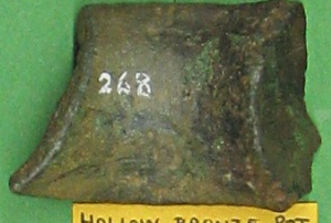
268 HOLLOW BRONZE POT LEG? SLIGHTLY BLACKENED. UNKNOWN DATE 01098754 PARSONAGE PARK 268 D 24-1-97