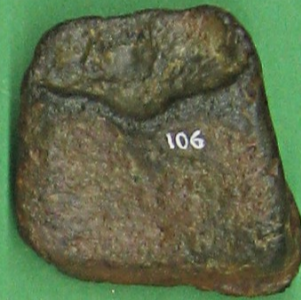
CAST RECEPTACLE LEG. BROKEN OFF PROBABLY THROUGH CONSTANT HEATING & COOLING. 13/17°C. FIRST SUMMER HILL 106 456 A 10.10.96