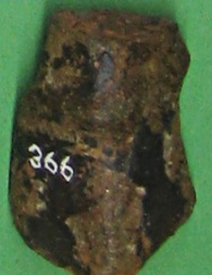
CAST BRONZE POT LEG. SY0007 8894 ROUGH EARS 366 364A 8.5.97