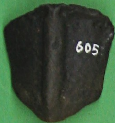
BRONZE POT LEG PRE 1750. SY0014 8772 ELM FIELD 605 928 D 20.3.98