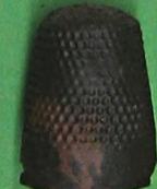
COPPER-ALLOY THIMBLE EVIDENCE OF TUNNING ON TOP. LOWER FIELD 418 1236 A 29-6-97