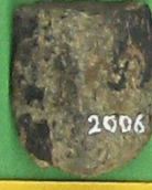
2006 CAST BRONZE POT LEG. LOWER LAMB PARK 1107. G. RB. 2006. 01098754. 28-3-06