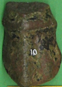
CAST RECEPTACLE LEG. FAIRLY COMMON, BUT NOT THE COMMON PARTS. 13 th TO 17 th CENTURY LOWER FIVE ACRES 10 B 2.8.96