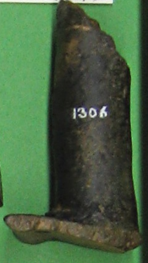
1306 BRONZE SKILLET OR POT HANDLE SY 0084 8680 GILLBROOK MEADOW 1306 1464F 5-10-01