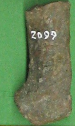
2099 BRONZE POT LEG OR HANDLE. FOUR ACRES 1308. C. ET. 2099. 00618709. 7-10-06