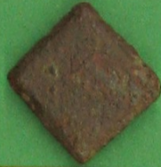
SQUARE COPPER-ALLOY MOUNT. PROBABLY A BELT DECORATION. TWO LUGS AT THE BARK. SEVEN ACRES 821 997F 4.11.98