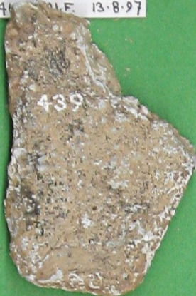
PART OF A CAST LEAD VESSEL? EVIDENCE OF BLACK- ENING ON INSIDE. WELL PATINATED C SEVEN ACRES 439 997B 23.7.97