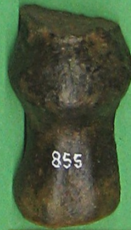
CAST BRONZE POT LEG. SY0082 8758 C QUARRY PARK 855 996B 19.11.98