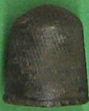
COPPER-ALLOY THIMBLE HIGHER LAMB PARK 993 G. RB. 1587 01098754 10-3-04