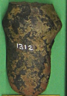
CAST BRONZE POT LEG. SY0109 8764 LOWER LAMB PARK 1312 1107A 2.11.01