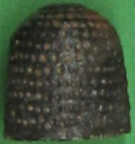
BEEHIVE THIMBLE CAST BRONZE P 14th 15th CENTURY PARSONAGE PARK 992 A RB 1608 01098754 13-4-04

Copper-alloy thimbles range from medieval times to the present, and they are fairly common finds in the fields. Presumably this is because when the women brought sustenance to their menfolk in the fields, they also brought their stitchery with them, losing thimbles as they did so. Many have inscriptions on them and some are of silver.