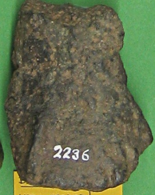
2236 VERY ERODED! APPLETREE HILL 815. F. JP. 2236. 99658790. 24-10-07