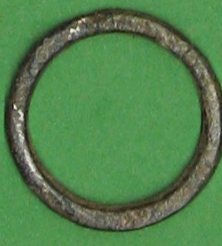
ROUGH-CAST COPPER-ALLOY RING. AT 30 MM. LARGER THAN USUAL. BRAKE CLOSE 910. C. RH. 1967.98838778.7.2.06