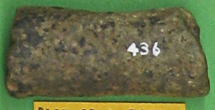
436 PART OF A CAST BRONZE POT HANDLE PRE 1750. SY 0074 8743 C SEVEN ACRES 436 1102 B 22-7-97