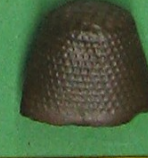
COPPER-ALLOY THIMBLE SEVEN ACRES C 1110 1102C 27-10-99