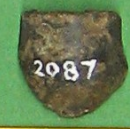
2087 TINY BRONZE POT LEG. FOUR ACRES 1308. C. ET. 2087. 00618709. 28-9-06