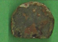
COPPER-ALLOY FURNITURE STUD. BONFIRE 539 1105D 20.12.97