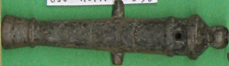
TOY CANNON PROBABLY 19 th C. PIT PARK 926 A. RB. 1860.99908766.12.11.05