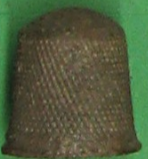
COPPER-ALLOY THIMBLE FLARED SKIRT LOWER LAMB PARK 1107 D. RB. 1691 01098754 2-10-04