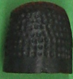
COPPER-ALLOY THIMBLE. SHEET METAL? SPIRALLY PUNCHED 15th 16th CENTURY? LOWER FIELD 930 B. PG. 1750 00518773 31-1-05