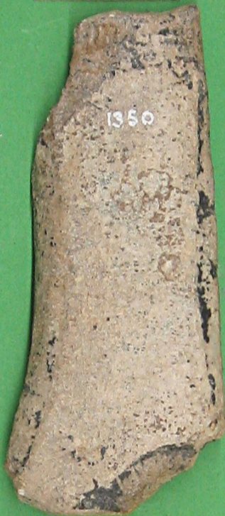
LEAD OR LEAD-ALLOY POT LEG. PARTLY FIRE-BLACKENED?! SY0084 8680 GILLBROOK ORCHARD 1350 1463E 27.7.02