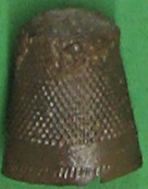
COPPER-ALLOY THIMBLE LOWER LAMB PARK 1107 D. RB. 1530 01098754 9-3-04