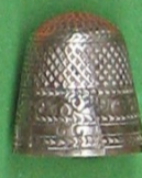
SILVER THIMBLE STAMPED: "99" EARLY 18th CENTURY P HIGHER MEADOW 474A. MS. 1822 00538865 2-7-05