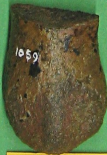
CAST BRONZE POT LEG. SY0183 8782 COTT LET 1059 ? 14.9.99