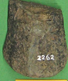
2262 BRONZE POT LEG. LOWER PITCHERS 807. B. PG. 2262. 00408814. 11-2-08