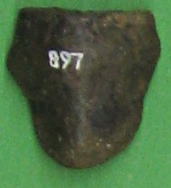
897 CAST BRONZE POT LEG. SY 0122 8780 PARSONAGE PARK 897 934D 29-1-99