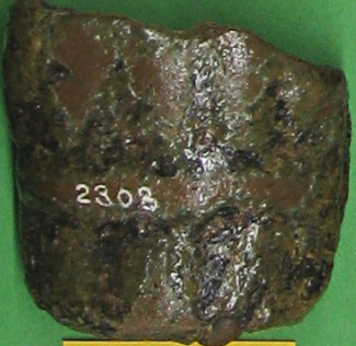
2308 CAST BRONZE POT LEG YONDER FIELD 805. A. PG. 2308. 00638784. 17-8-08