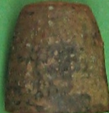
CAST COPPER-ALLOY THIMBLE. 16th CENTURY HAND-PUNCHED P INDENTATIONS C STILE PARK 978 1493D 4-6-99