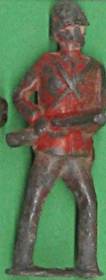
LEAD SOLDIER PARIONAGE PARK 992 A RB 1598 01098754 8.4.04