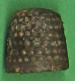
COPPER-ALLOY THIMBLE 15th-16th CENTURY P MIDDLE FIELD 938 B. PG. 1824.00408814 11-8-05