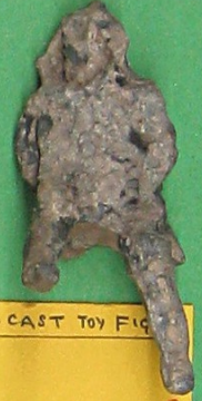
DIE-CAST TOY FIG BLAKE'S PLOT 1376 1798A 11.5.03