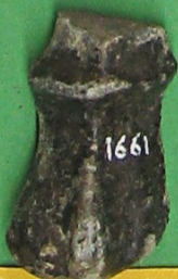
BRONZE POT LEG HIGHER SHEPHERD PARK 1000 A. J9 1661 00909750 14.7.04