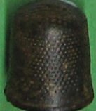
DAMAGED THIMBLE. COPPER ALLOY. ONE-PIECE, NARROW BORDER & FLATTENED CROWN. 1700-1750 C BRAKES CLOSE 126 M 28-9-96