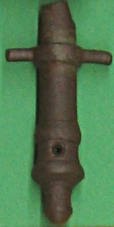
BROKEN TOY CANNON STONEY LANE FIELD 1251 420 B 30.1.01