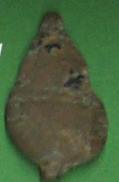
ACORN MOUNT POST-MEDIEVAL. PARSONAGE PARK 992 D RB 1592 01098754 5.4.07