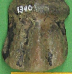
1340 CAST BRONZE POT LEG. SY 0084 8680 GILLBROOK MEADOW 1340 1464C 20-7-02