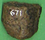
CAST BRONZE POT LEG. SY0051 8773 C MIDDLE FIELD 671 999F 7.7.98