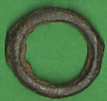
ROUGH-CAST COPPER-ALLOY RING. UNWORKED. EVIDENCE OF JOINTS TO OTHER RINGS. LITTE TANK HILL 909. C. RH. 1888.98838778.9.12.05