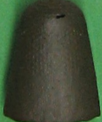
COPPER-ALLOY THIMBLE GREAT CRAYTONS 1289 355A 6-9-01