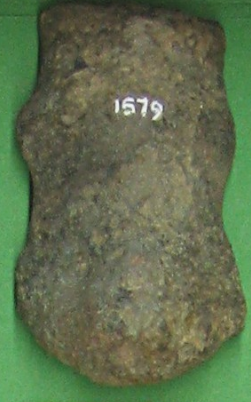
1579 BRONZE POT LEG HIGHER LAMB PARK 993 A RB 1579 01098754 26-3-04