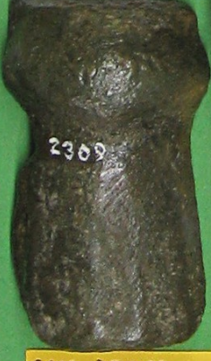
2309 CAST BRONZE POT LEG. YONDER FIELD 805. B. PG. 2309. 00638784. 17-8-08