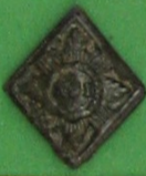
COPPER-ALLOY MILITARY MOUNT? CAST. WITH NOS:- '19X', 'X61' OR 'X01'. EIGHT ACRES 1185 1093B 30.5.00