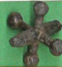
DIE-CAST "JACKS" COUNTER. HILL CLOSE 1307 F. ET 1677 00618709 8.9.04