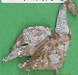
LEAD TOY GOOSE RECENT GLOBE FIELD 636 1101A 30.5.98