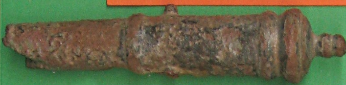
CAST BRASS TOY CANNON NEWTON'S FIELD 1377 730A 18.5.03

As today, children have always taken their toys outside to play with them, and finds range from the eighteenth century toy guns or petronels to the Dinky toys of our own generation.