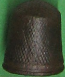
COPPER-ALLOY THIMBLE. PROBABLY GEORGIAN C SEVEN ACRES 845 997F 9-11-98