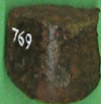
SMALL CAST-BRONZE POT LEG. SY0150850 MEAD 769 667B 12.9.98