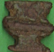
DECORATIVE COPPER-ALLOY MOUNT. UPR-SHAPED. POSSIBLY MEDIEVAL. FOUR ACRES 216 G 26.11.96