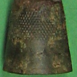
COPPER-ALLOY THIMBLE FIR FIELD 880 809A 28-12-98