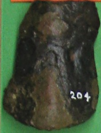
BRONZE RECEPTACLE LEG. VERY FIRE- BLACKENED. C SY0093 8758 THORN PARK 204 C 18.11.96