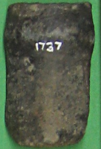
BRONZE POT LEG HIGHER LAMB PARK 993 A. RB. 1737 01098754 4.12.04