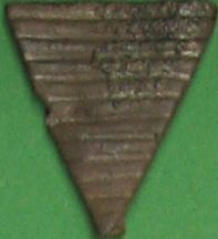
TRIANGULAR RIDGED MOUNT. MIDDLE FIELD 908.C. RH. 1899.98838778.13.12.05