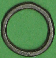
ROUGH-CAST COPPER-ALLOY RING. COMMON FINDS. POSSIBLY A BELT HANGER. LOWER LAMB PARK 1107 C RB. 1539 01098754 13.3.04