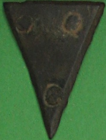
COPPER-ALLOY P TRIANGULAR MOUNT. ROUGH CUT FROM SHEET PROBABLY A HOME-MADE HARNESS OR BELT MOUNT. QUARRY PARK 970 1003D 26.5.99