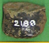
2188 SMALL POT LEG FOUR ACRES 1308. B. ET. 2188. 006891900. 30-8-07