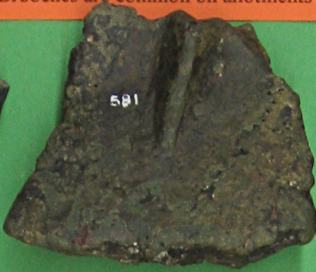
LARGE BRONZE POT LEG. SY0062 8700 HIGHER HAM 581 1390B. 9.2.98