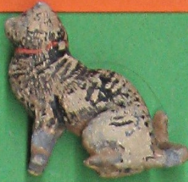
LEAD TOY CAT SANDY HILLS 464 1235.A 25.8.97