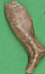
PART OF A HIND LEG OF A TOY LEAD HORSE? LITTLE TURNPIKE FIELD B17.C.3P. 2238.99658790.24.10.07