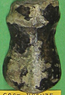
2429 CAST BRONZE POT LEG. HOSPITAL 1522. E. RH 2429 2-11-15