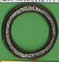
ROUGH-CAST COPPER-ALLOY RING. GILLBROOK ORCHARD 1210 1463 D 25.6.00