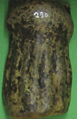
250 CAST RECEPTACLE OR SKILLET LEG. P NOTE THE RIBBING. SY 0083 8758 C BONFIRE 250 G 18-1-97