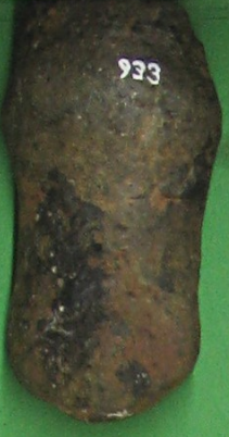
933 CAST BRONZE POT LEG SX 99658790 C APPLEDORE HILL 933 816A 9-4-99