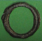
ROUGH-CAST COPPER-ALLOY RING. 29 MM. SMALLER THAN USUAL. EVIDENCE OF A JOINING FLANGE. MIDDLE FIELD 908. C. RH. 1995.98838778.19.3.06