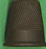
COPPER-ALLOY THIMBLE. VICTORIAN TO RECENT. SOWHILL MEADOW 1000 1086C 18-6-99