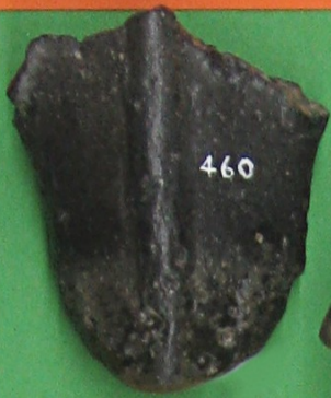
CAST BRONZE POT LEG. PRE 1750. C METAL MUCH BLACKER THAN USUAL. SY 0052 8738 GLOBE FIELD 460 13.8.97