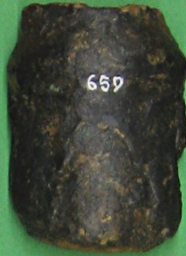
CAST BRONZE POT LEG. MUCH FIRE- BLACKENED. PRE 1750. SY0061 8702 FOUR ACRES 659 1308G. 28.6.98