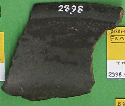
2398 BRONZE POT FRAGMENT. THORN PARK 1104. A. PG. 2398. 00838758. 7-11-10