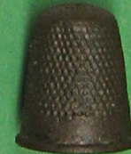
COPPER-ALLOY THIMBLE. PROBABLY RECENT. ELM FIELD 750 928C 31-8-98