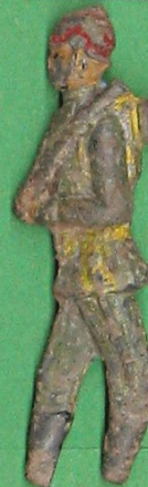
LEAD SOLDIER. GERMAN SOLDIER, EARLY 20 th CENTURY APPLE TREE HILL B1 I 31.8.96