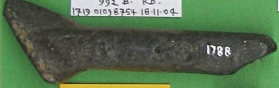
1788 SKILLET LEG HILL CLOSE 932 A. PG. 1788 00638784 2-4-05