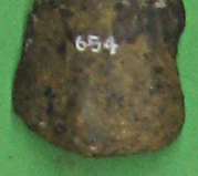
654 SMALL CAST BRONZE POT LEG. SY 0061 8709 FOUR ACRES 654 1308 I. 25-6-98