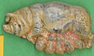
LEAD TOY PIG GLOBE FIELD 1075 1101A 4.10.99