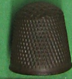
COPPER-ALLOY THIMBLE. PROBABLY 19th-20th CENTURY. GILLBRIDG & ORCHARD 1206 1463A 15-6-00