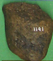
CAST BRONZE POT LEG SY0170 8695 C TWO ACRES 1141 1358B 5.3.00