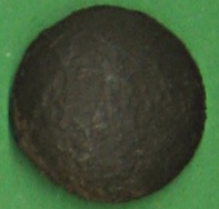
COPPER-ALLOY DOMED MOUNT. PENTER FILLED. TWO IRON MOUNTING LUGS. FURZE BUSHES 987 458 B 10.6.99