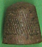
COPPER-ALLOY THIMBLE. PARSONAGE PARK 992 B. RB 1609 01098754 13-4-04