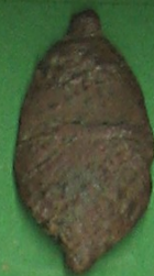
ACORN MOUNT 16 C. GLOBE FIELD 1101 A PG. 1520 00538735 5.3.06