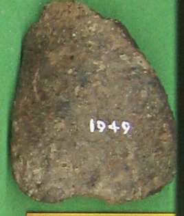
1949 BRONZE POT LEG. BRAKE'S CLOSE 910. D. RH. 1949. 98838778. 30-1-06